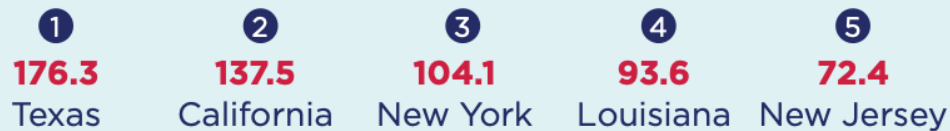
Top State Exporters of Goods to Lithuania ($ millions)